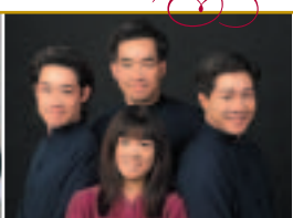
The Ying Quartet