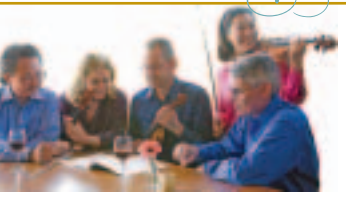
The Finger Lakes Chamber Ensemble